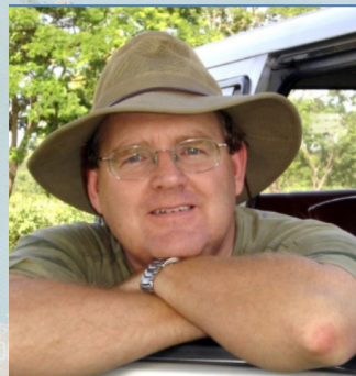
Spoken Worldwide Restricted Countries