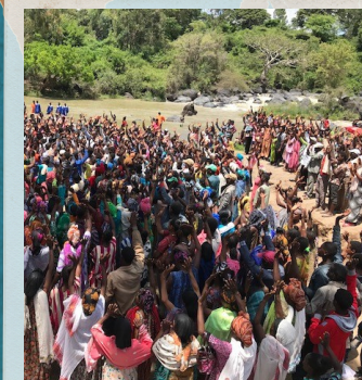
New Generations Horn of Africa