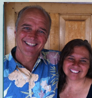
YWAM Pichilemu, Chile