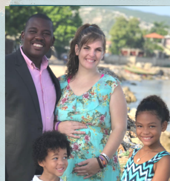
One Gift, One Child Haiti