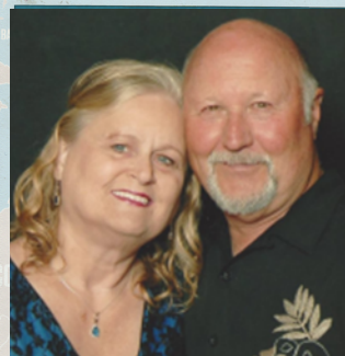
Fridays at Five Scotts Valley