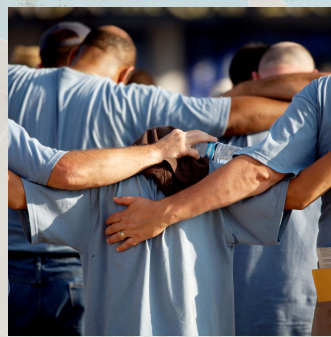
Teen Challenge Monterey Bay Watsonville