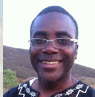
Ahead Ministries West Africa