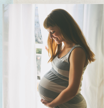
Pregnancy Resource Center Santa Cruz